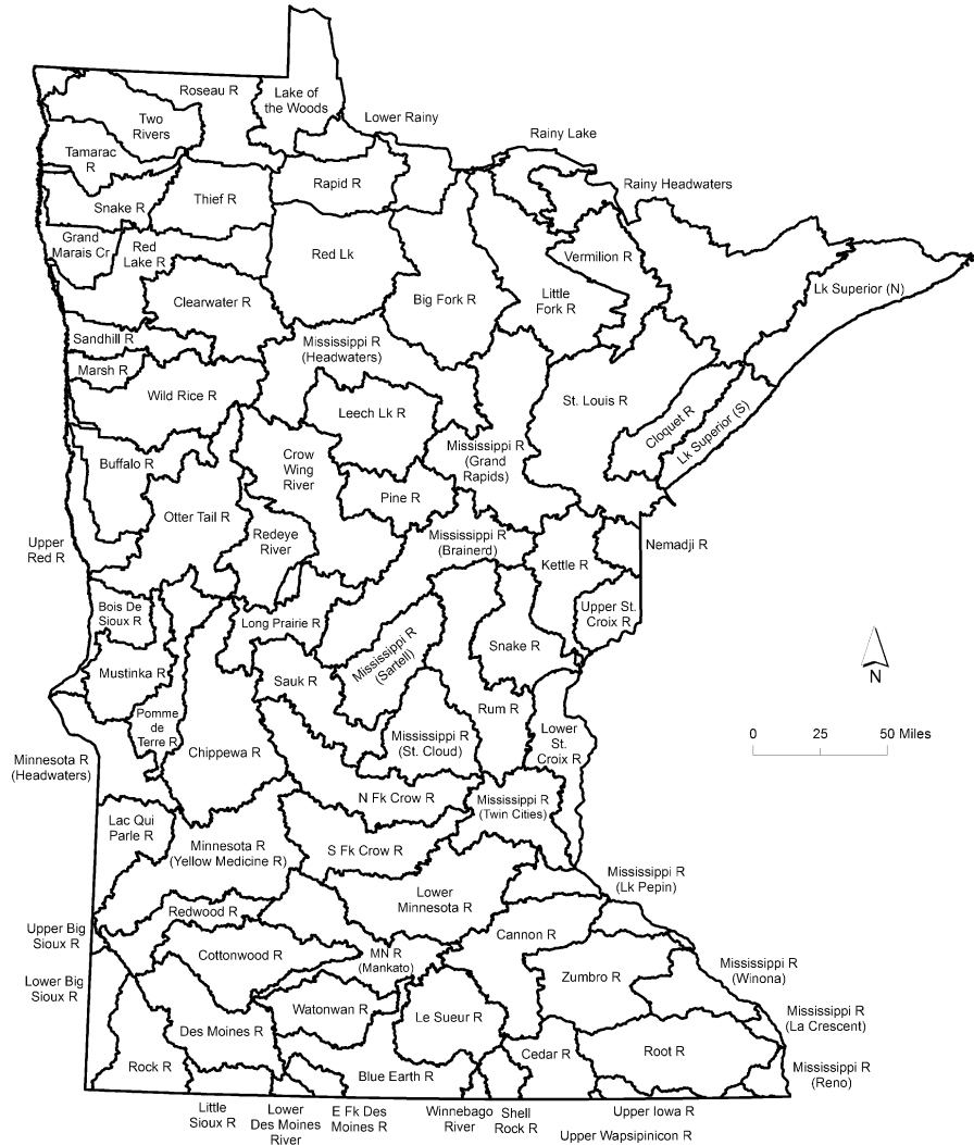
Major Watersheds in Minnesota

Statutory Authority: MS s 115.03; 115.44