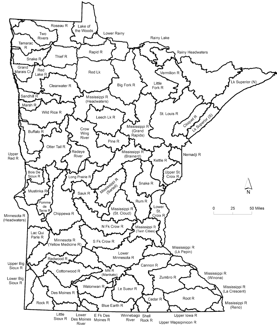
Major Watersheds in Minnesota

Statutory Authority: MS s 115.03; 115.44